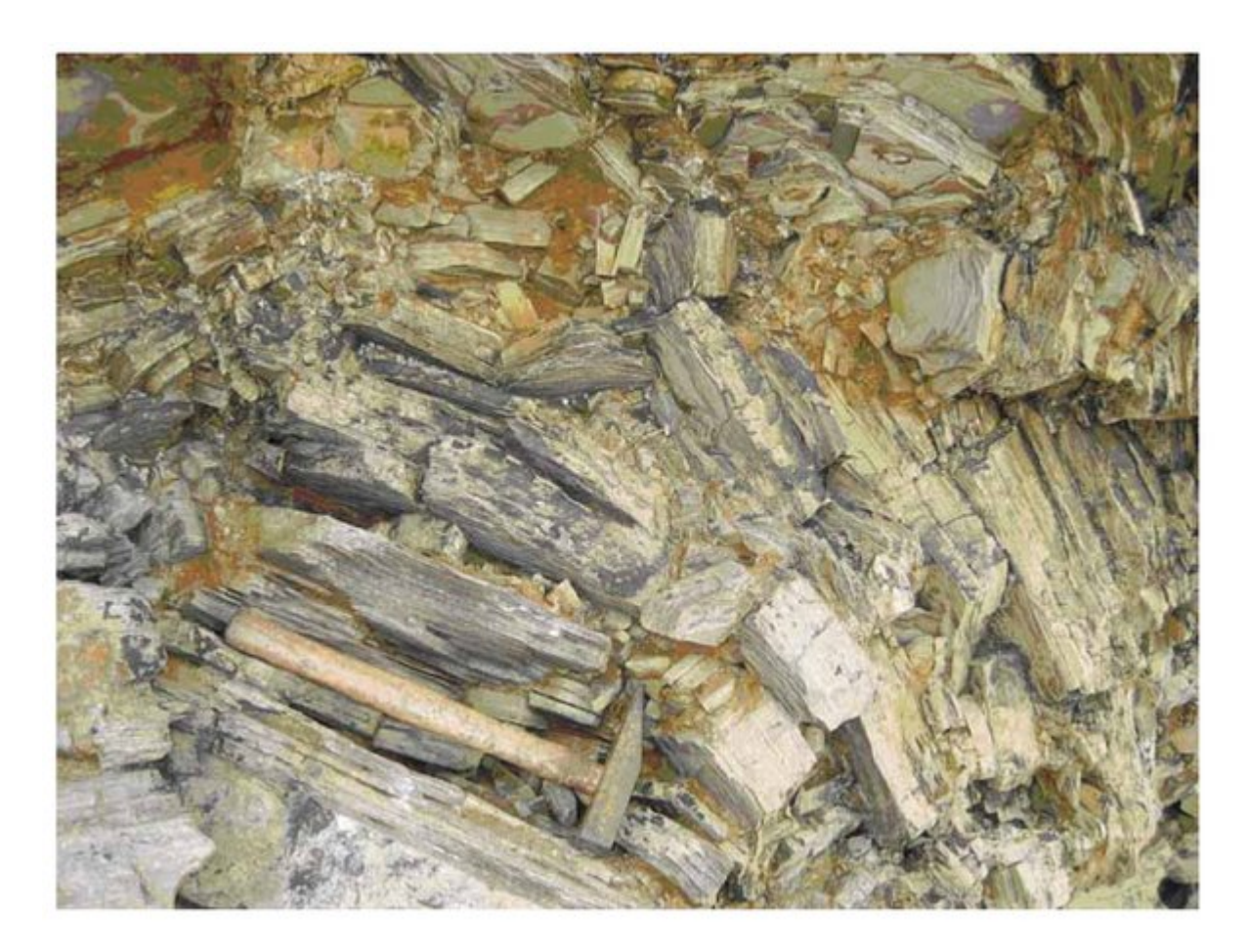
(Plate 10) Collapse breccia in the cliffs at Marsden Bay.