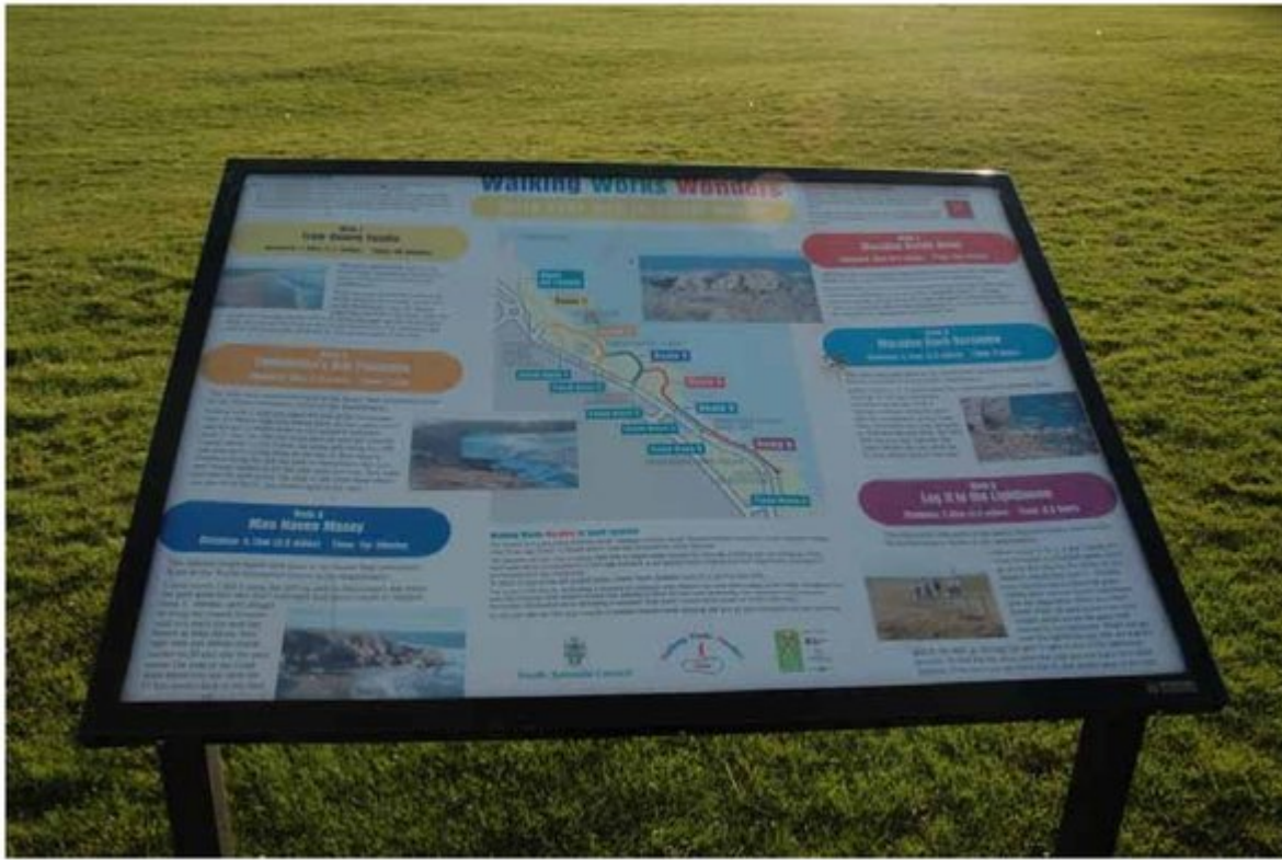
(Plate 23) 'Walking Works Wonders' board south of Lizard point.