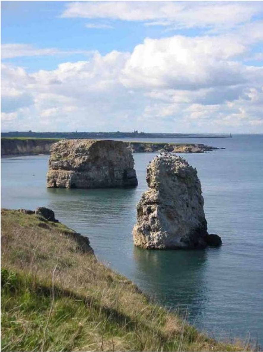
(Plate 9) Coastal stacks in the Roker Dolomite Formation seen from Lizard Point.