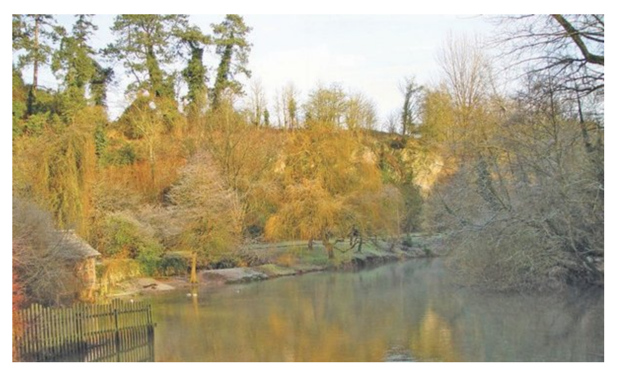
(Figure 96) River Mells, Great Elm.