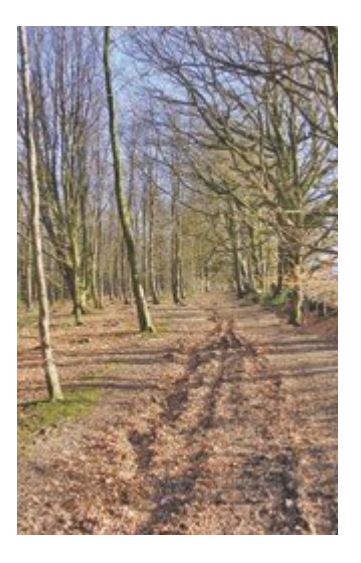
(Figure 97) Cranmore Woods.