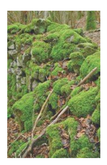
(Figure 105) Mossy drystone wall.