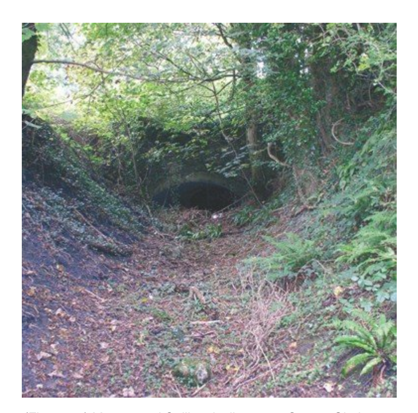
(Figure 98) Moorewood Colliery incline, near Gurney Slade.