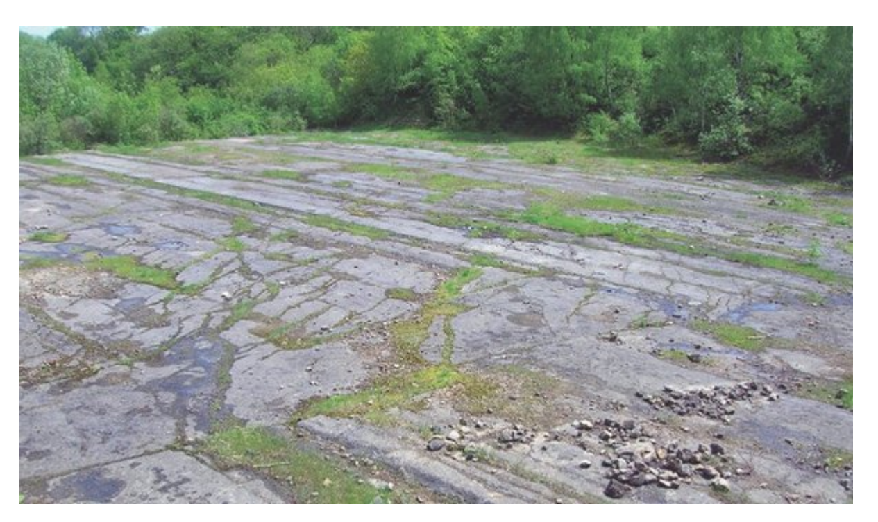
(Figure 104) The flat unconformity surface at Tedbury Camp Quarry.