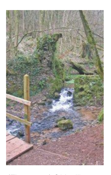
(Figure 106) Old mill waterworks, Harridge Wood.