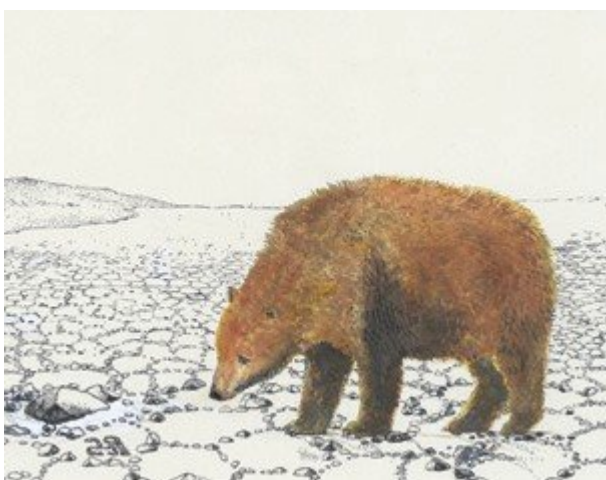
(Figure 10) Cave bear.