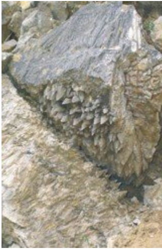
(Figure 100) Calcite crystals on a Neptunian dyke, Cloford Quarry.