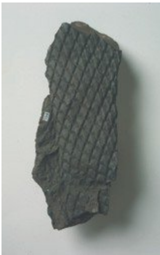
(Figure 99) Lepidodendron bark impression, Coal Measures, Radstock.