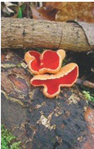
(Figure 102) Scarlet elf cups on wood log