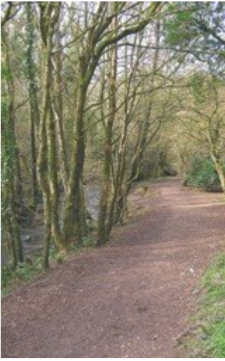
(Figure 103) Vallis Vale.