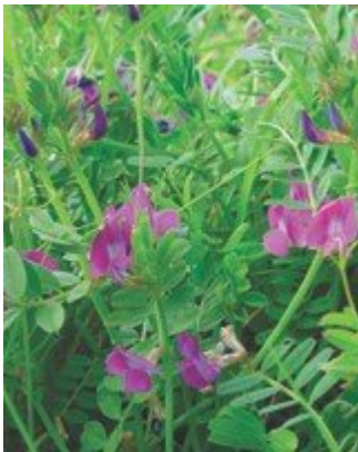
(Figure 121) Common vetch.