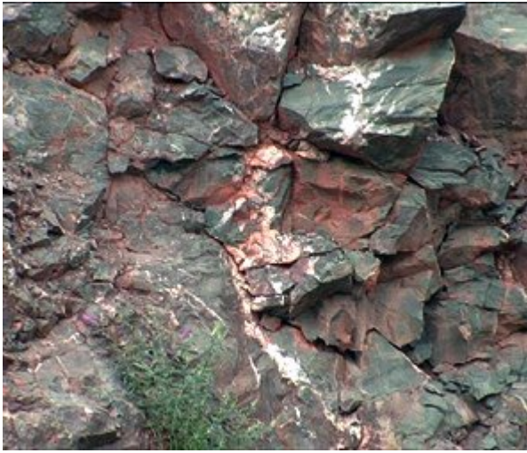
Quartz vein mineralisation in Whitwick Quarry.