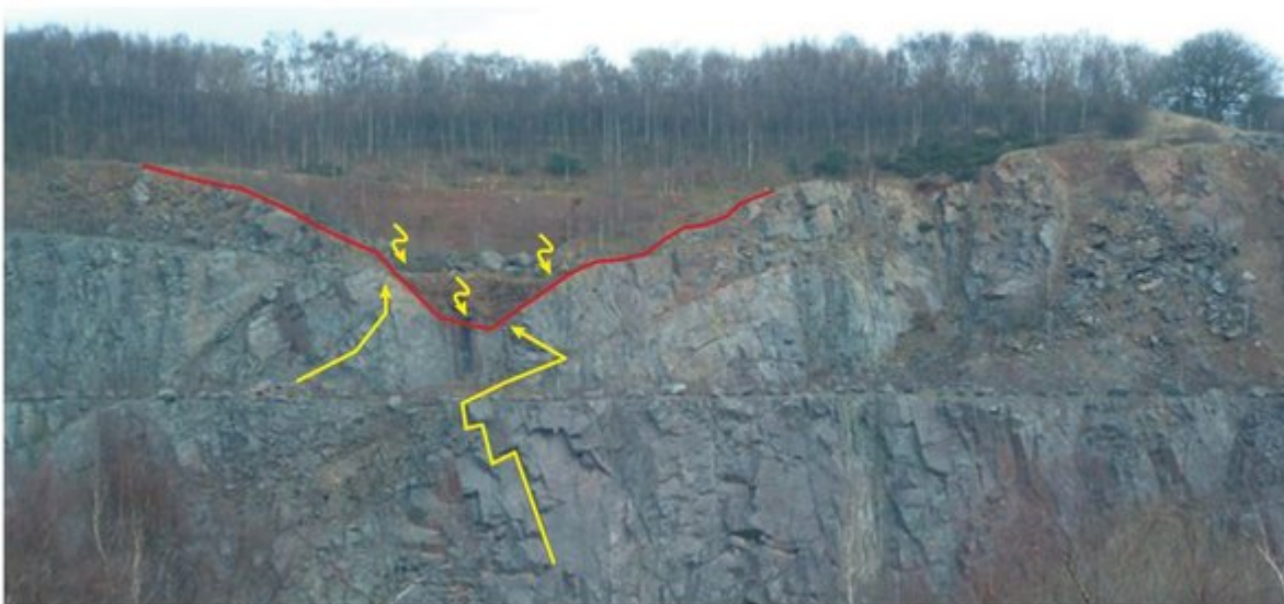
Typical pathways for mineralising fluids (yellow), towards the Triassic unconformity (red).