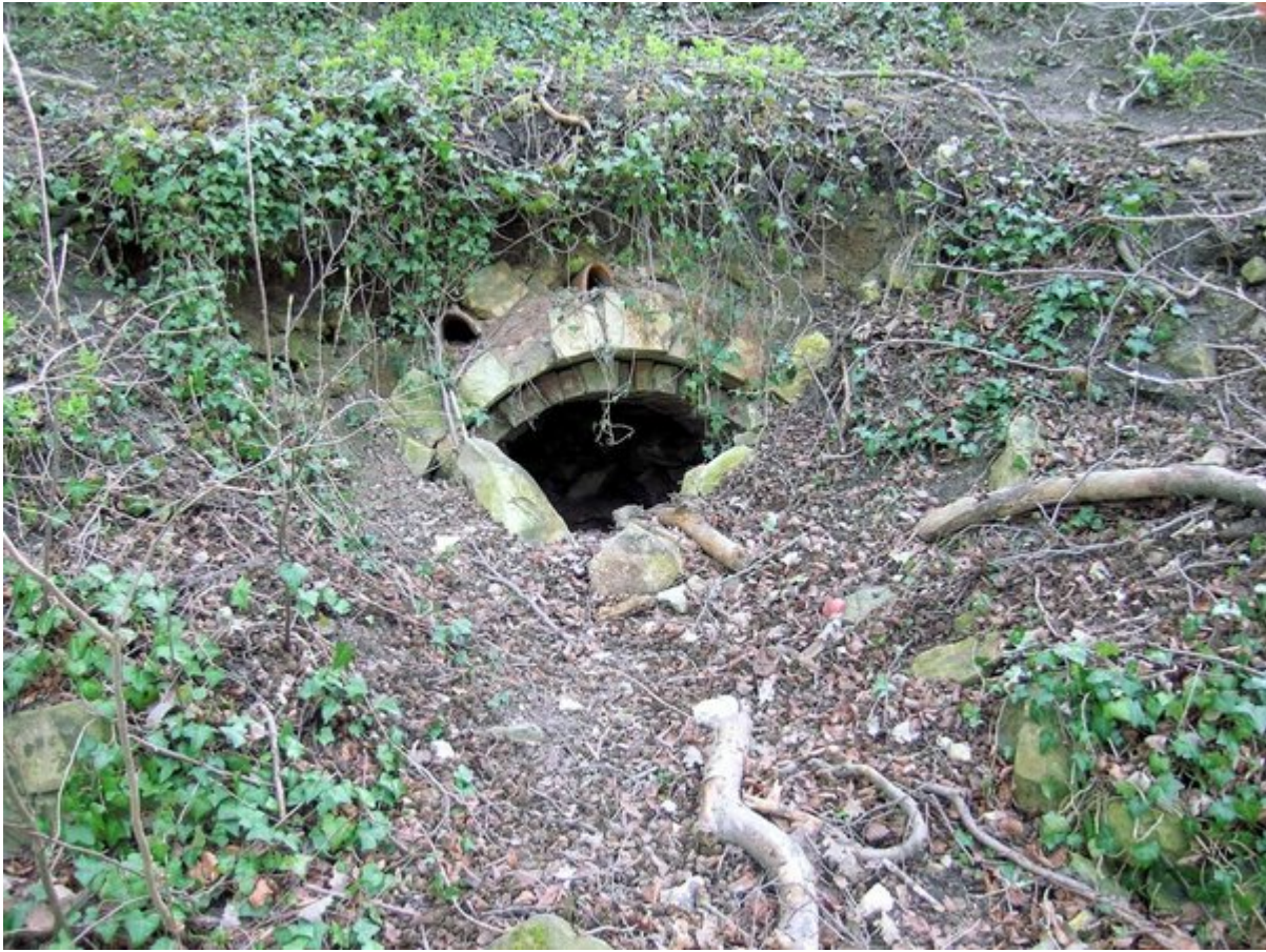
(Figure 117) General view of cave entrance from 1997 survey. [SE 53784 01029].