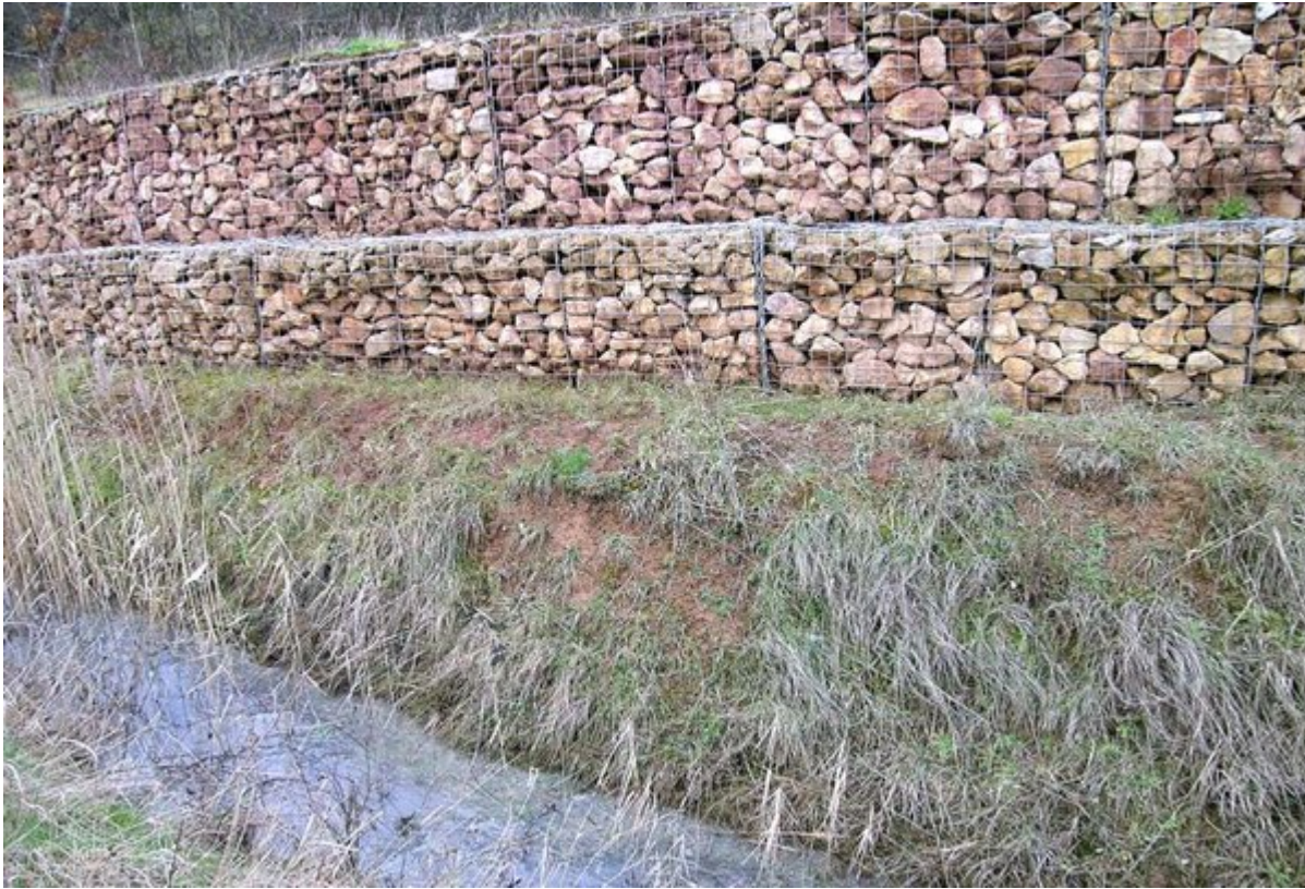
(Figure 125) Exposure of weathered red marl of the Edlington Formation. [SE 52280 06679].