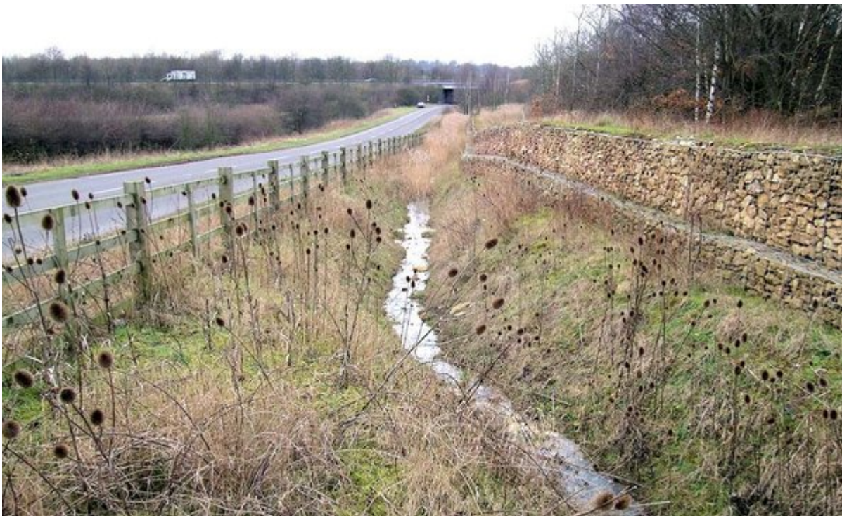
(Figure 124) General view along drainage ditch to the west. [SE 52340 06650].