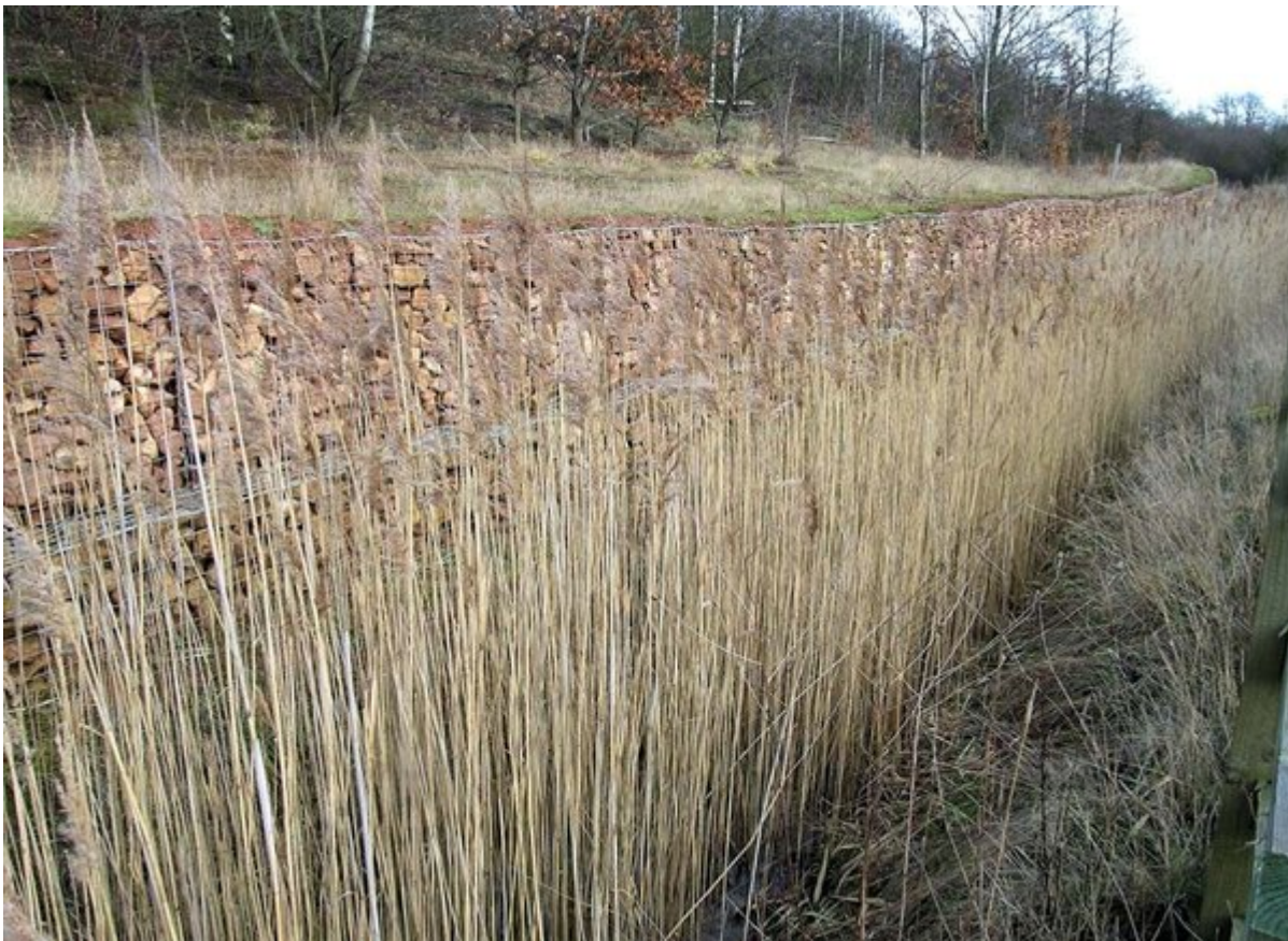
(Figure 126) View of osiers that largely obscure the exposures of marl in the drainage ditch. [SE 52280 06679].