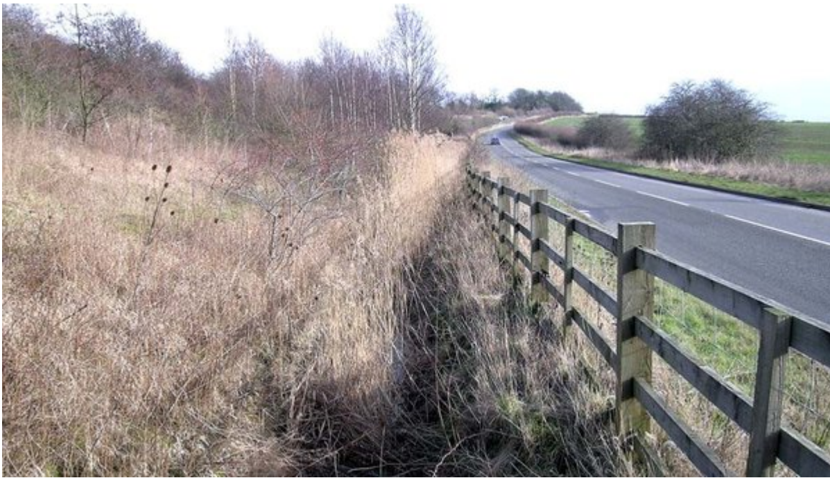
(Figure 123) General view along drainage ditch to the east. [SE 52150 06720].