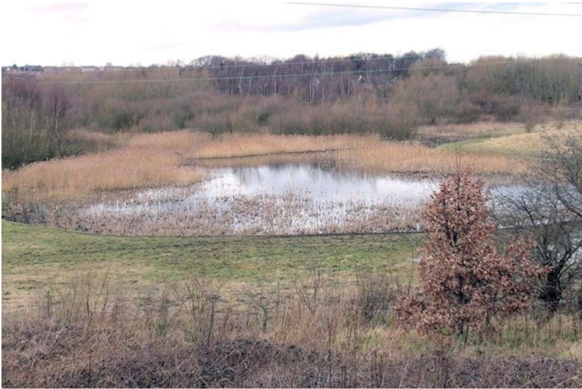
(Figure 16) Wetlands associated with the former course of the River Don. [SK 48894 99473].