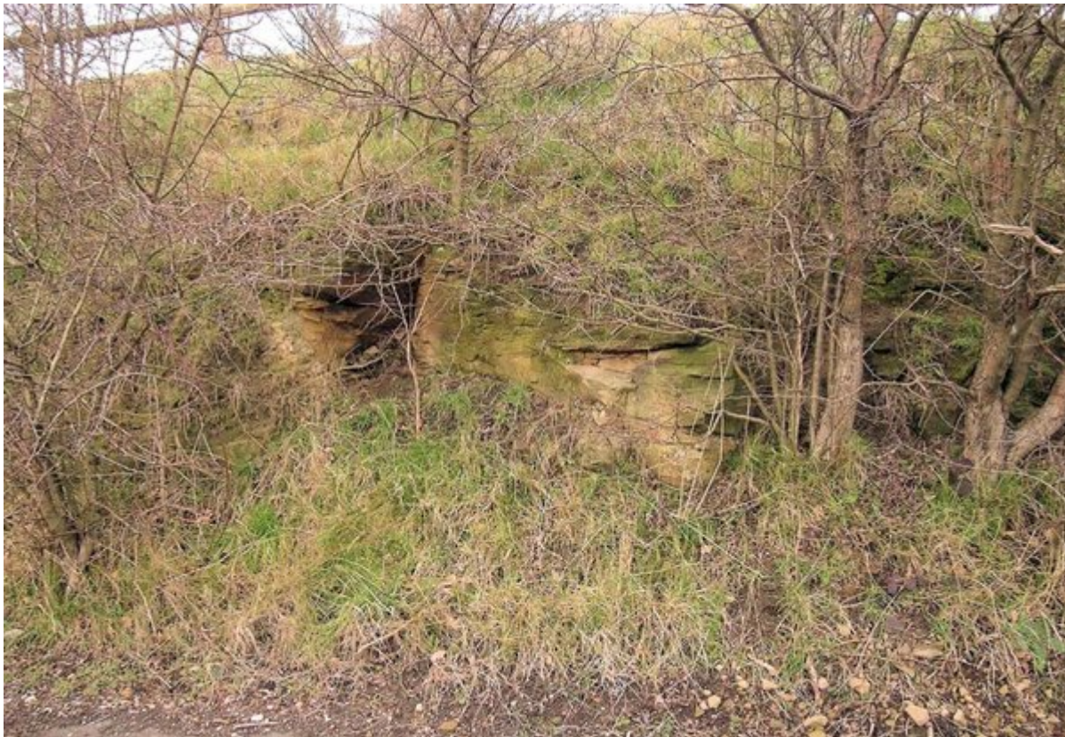
(Figure 15) Road cutting exposure of Mexborough Rock with vegetation overgrowth.[SK 48974 99510].