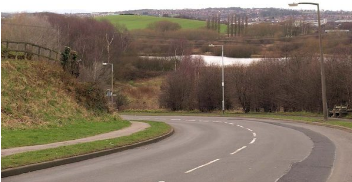
(Figure 17) View to the Don Valley over a fault and down the escarpment. [SK 48870 99500].