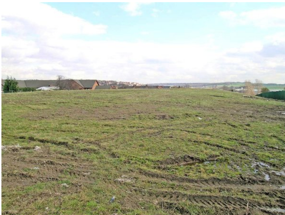
(Figure 22) General view to the east. [SE 46116 00093].