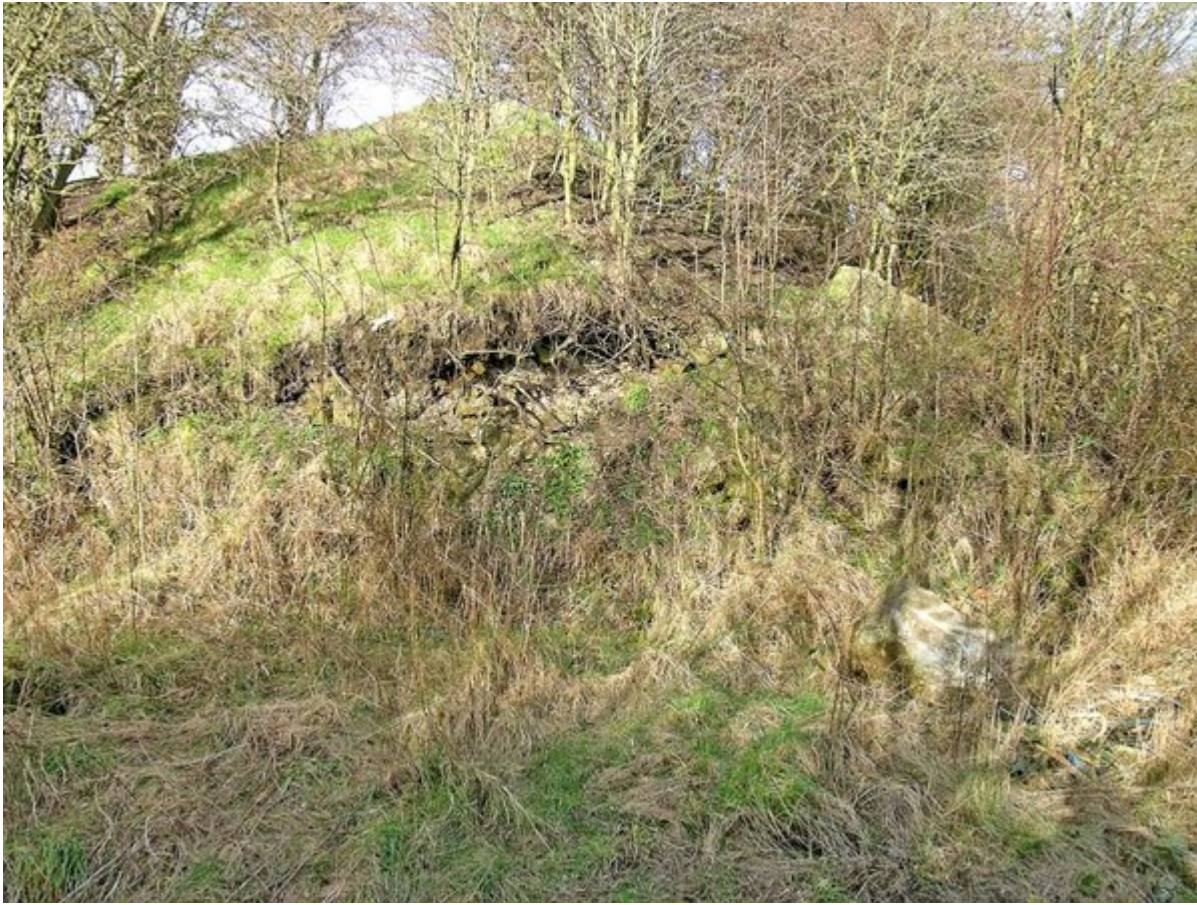
(Figure 24) Exposure A. Massive Ackworth Rock overlain by flaggy rock and soil in embankment. [SE 47721 03309].