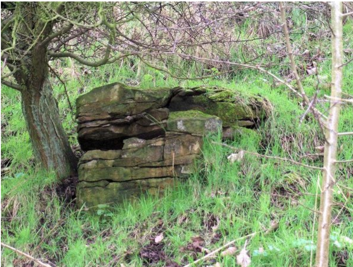
(Figure 25) Exposure B. Cross bedded sandstone. [SE 47934 03075].