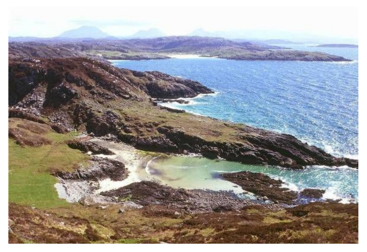
(Figure 23) Rugged coastline north of Achmelvich. BGS Photo P 513583 — M Krabbendam.