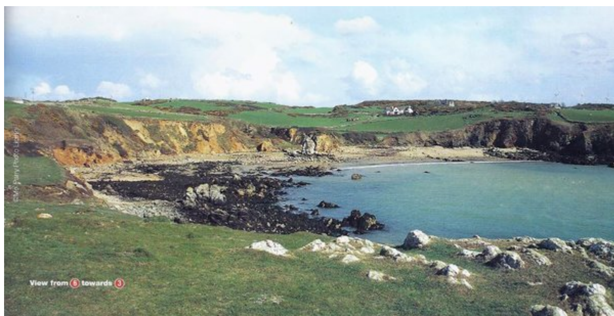
View from [6] Llanbadrig Point looking towards [3] across Porth Padrig.