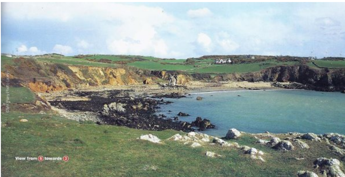
View from [6] Llanbadrig Point looking towards [3] across Porth Padrig.