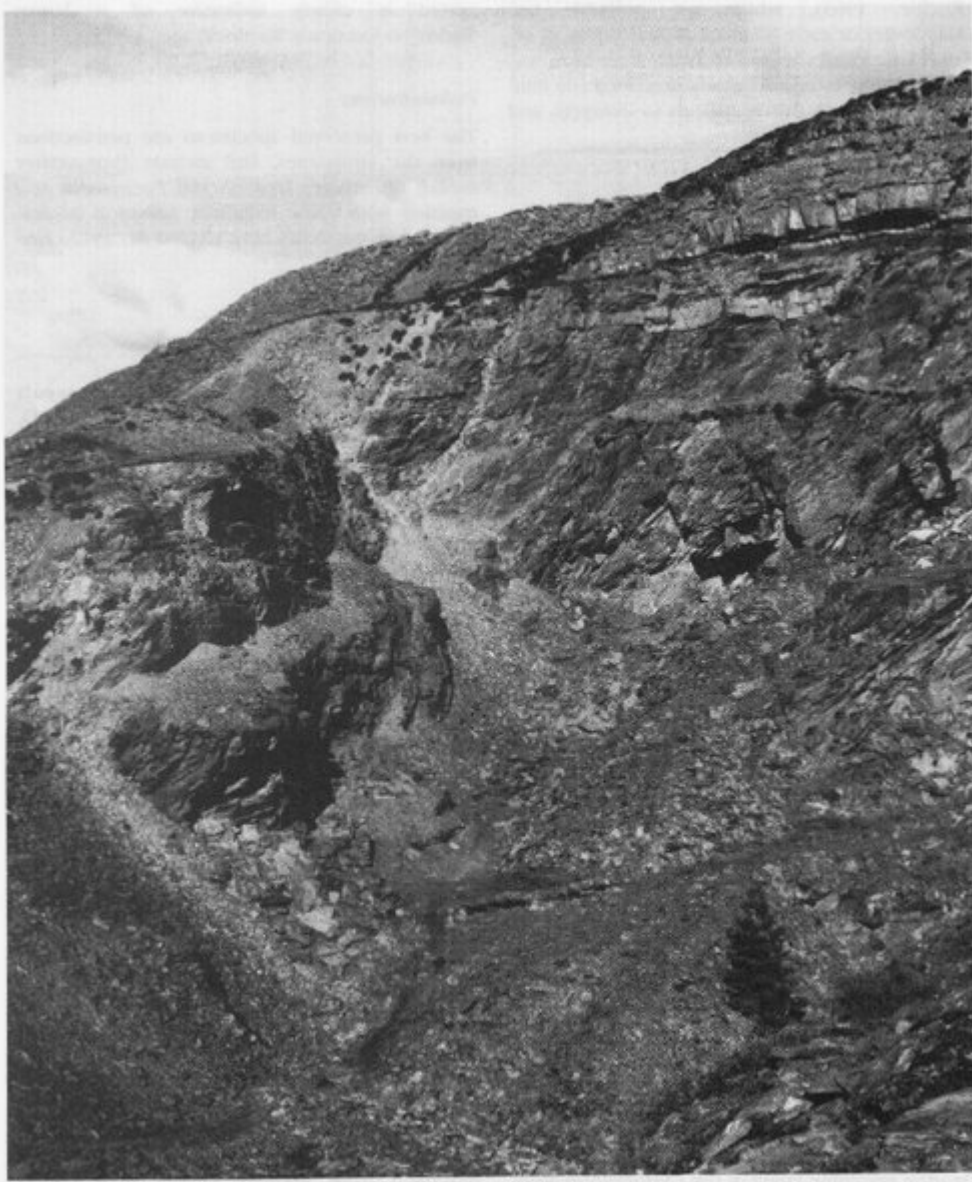
(Figure 3.6) Pen-y-Glog Slate Quarry. Cleaved Pen-y-Glog Slates in the lower part of the quarry face, that have yielded Berwynia. These are overlain by turbidites of the Pen-y-Glog Grits, that contain Prototaxites.