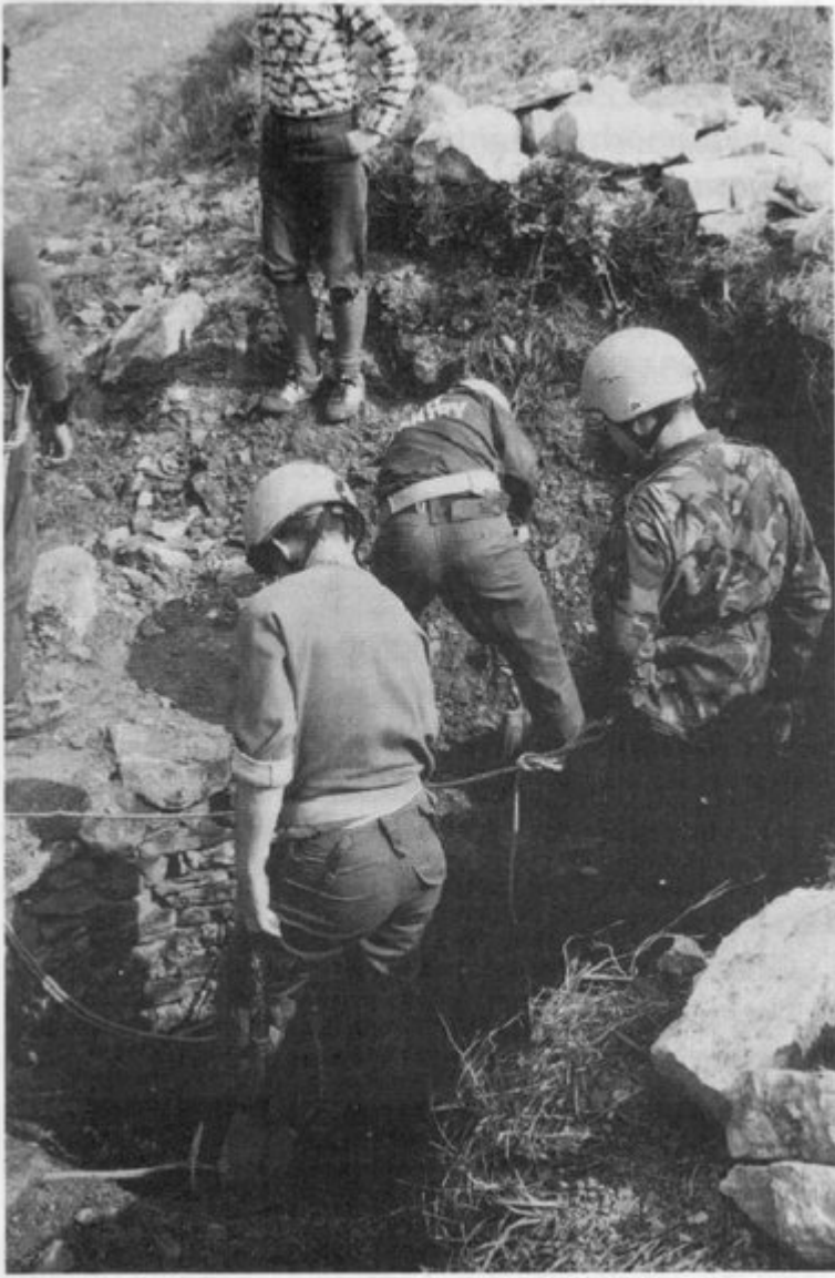
(Figure 6.7) View of the entrance to an adit at Stonesfield, re-opened in 1980 in an operation funded by the Nature Conservancy Council.