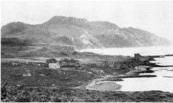
A.—View of Ben Hiant, Ardnamurchan, from west (For Explanation, see p. viii.)