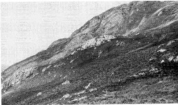
B.—Marginal Scarp of Ben Hiant Intrusion, seen from south-east (For Explanation, see p. viii.)

(Plate 1) A. View of Ben Hiant, Ardnamurchan, from west. Main mass of this rocky hill is Ben Hiant Intrusion (see (Figure 19), p. 160). Maclean's Nose to right is agglomerate. Junction of these rocks extends from shore up well-marked hollow, seen on photograph above Mingary Castle (see also Plate 1, B). Stallachan Dubha is formed of outlying portion of Ben Hiant Intrusion. Scarp-features in middle distance are due to cone-sheets. Mingary Castle stands on a craignurite sill. Promontory beyond is Rudha a' Mhile ((Figure 25), p. 177). Geological Survey Photograph, No. C2829 . B. Marginal Scarp of Ben Want Intrusion, seen from south-east. The view is taken from west of Stallachan Dubha (see Plate 1, A and Explanation). The Ben Hiant Intrusion is closely jointed. Vent-agglomerate forming foreground contains two large masses of big-felspar basalt (p. 126), one in centre of view, the other to the left. Geological Survey Photograph, No. C2850 .