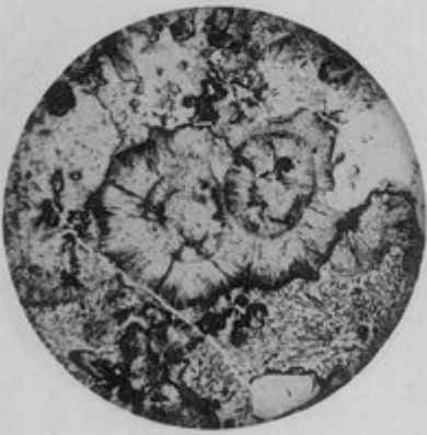
Fig. 2. Spherulitic Felsite. x 30.