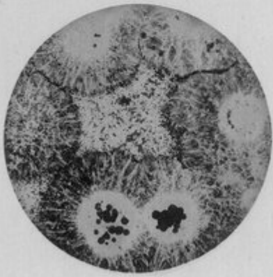
Fig. 2. Jasper. x 30.