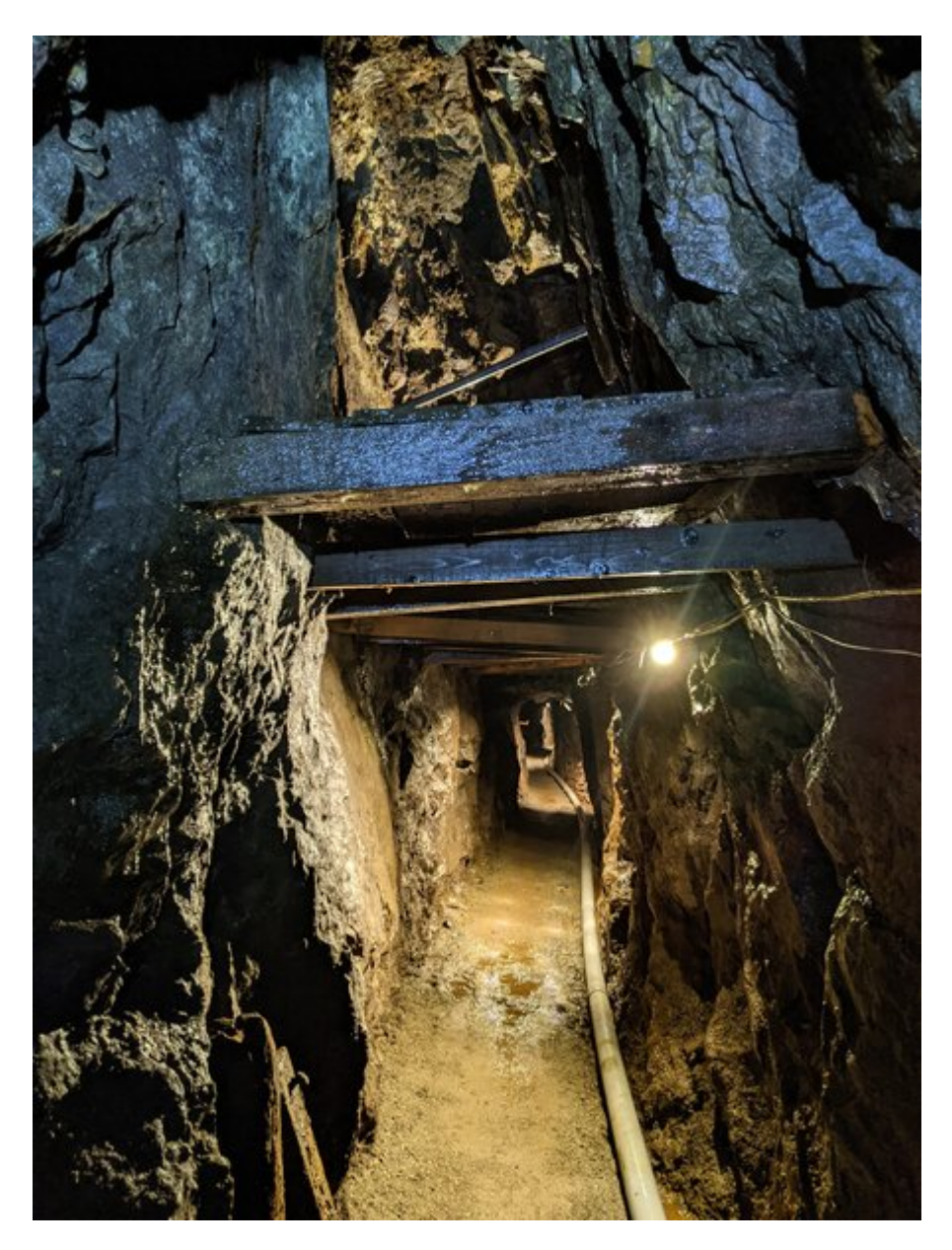
Lochnell Mine. A view underground. This mine is open to the public through the Lead Mining Museum.