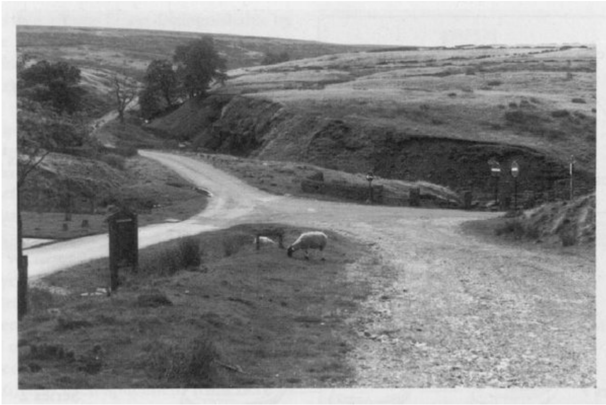
(Figure 10.15) Lower Langsetian deposits exposed at Goyt's Moss.