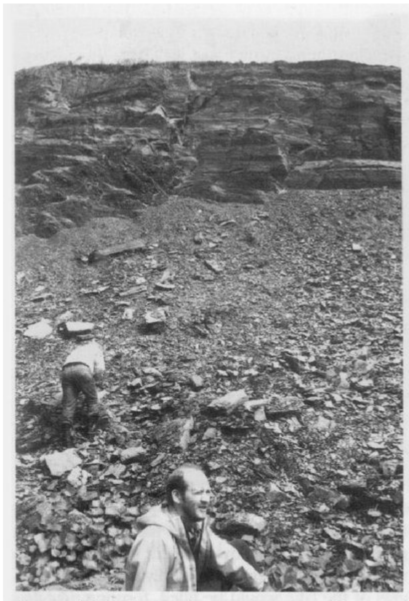
(Figure 10.9) Langsettian exposures at Neepsend Brickworks.