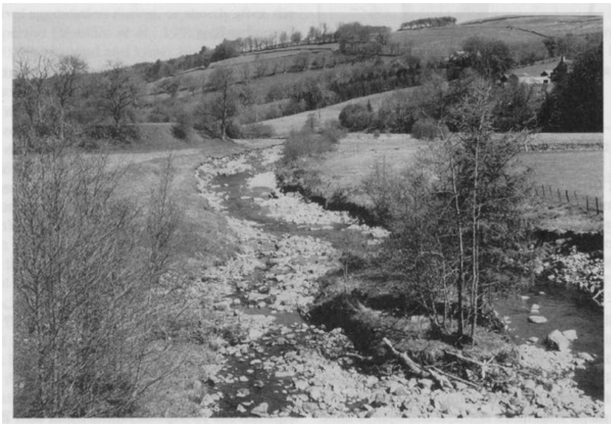
(Figure 5.17) Blackett Bridge, River West Allen, looking downstream in a northerly direction, showing a late Roman age terrace on the left of the present channel and a 19th century terrace on the right.