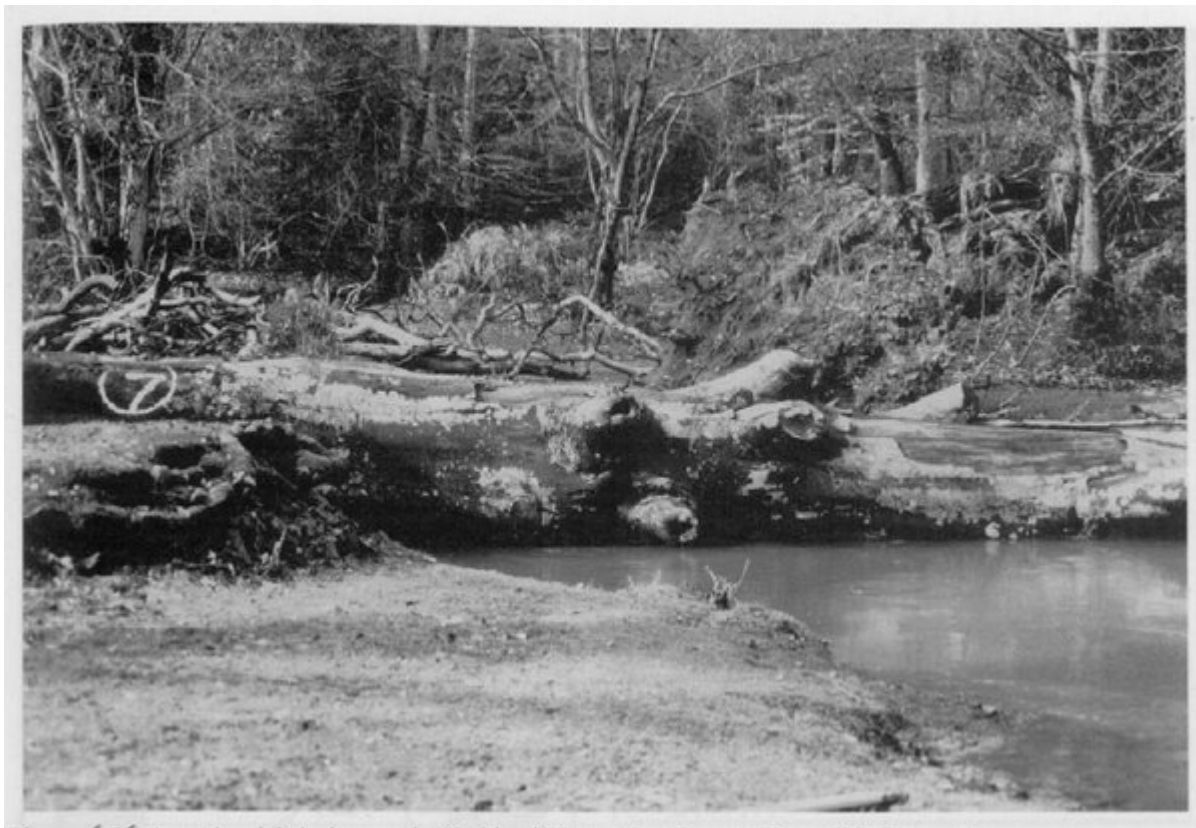
(Figure 6.16) An active debris dam on the Highland Water, New Forest.