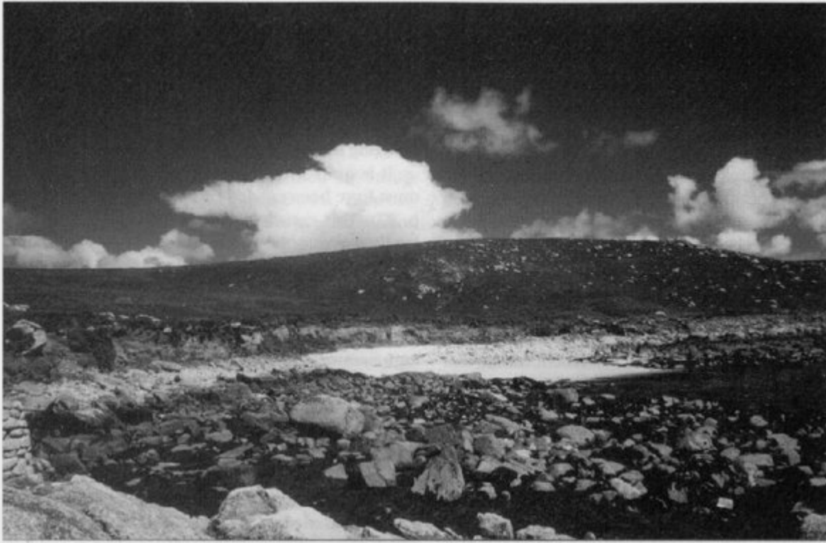
(Figure 8.13) Quaternary sediments exposed in coastal cliffs at Castle Porth, Tresco. The Hell Bay Gravel at the northern end of the exposure (left) is rich in erratics, whereas erratics are absent at the southern end (right) of the section.