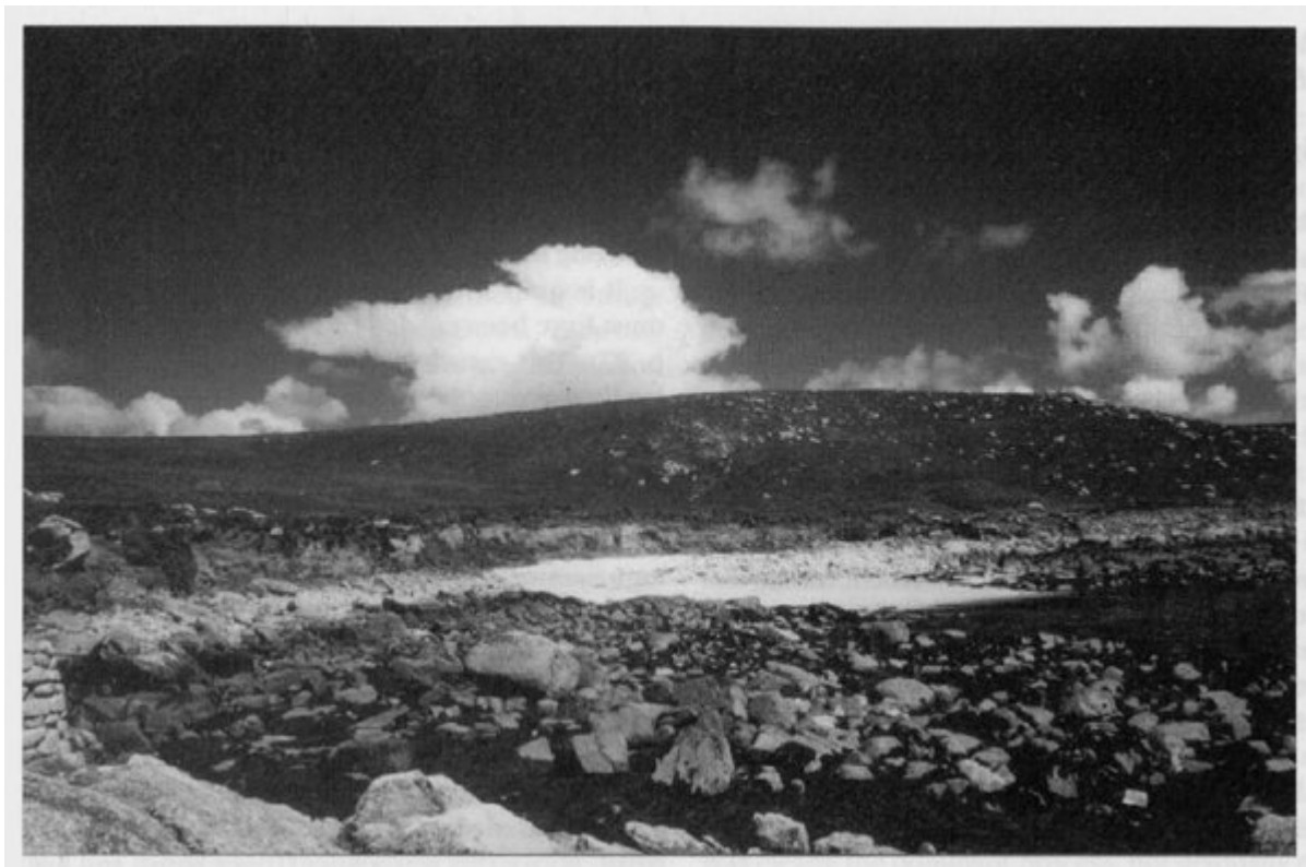
(Figure 8.13) Quaternary sediments exposed in coastal cliffs at Castle Porth, Tresco. The Hell Bay Gravel at the northern end of the exposure (left) is rich in erratics, whereas erratics are absent at the southern end (right) of the section.